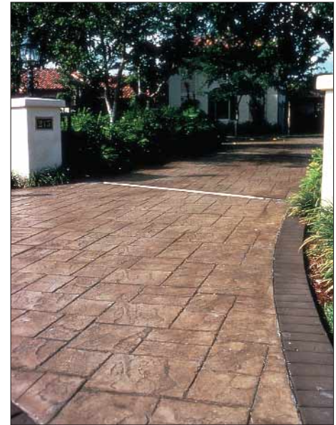
Pattern stamping and colored release agents are applied to integrally colored concrete for unique effects.