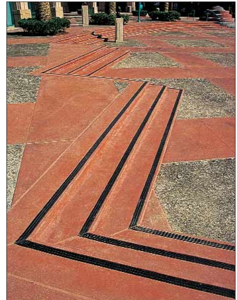
Integral color adds a design dimension to otherwise ordinary concrete.