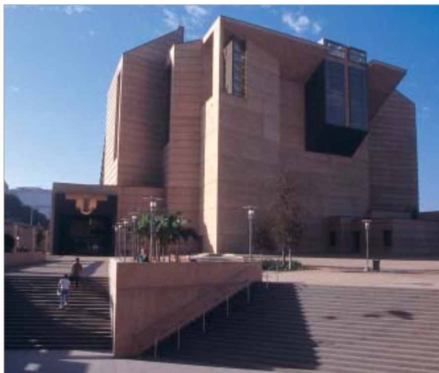
Sandblasting produced a roughened surface that scatters reflected light to soften the impact of mottling

The colorants for the Cathedral were supplied by Davis Colors, Los Angeles, a brand of Rockwood Pigments and a world-wide leader in concrete color