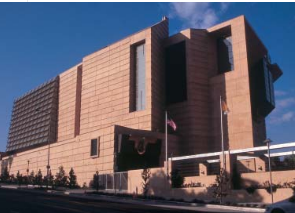
The earthy golden cast recalls the hue of the adobe used to build the first mission churches in the region

character and vitality.” Indeed, many visitors to the Cathedral assume that the Cathedral is made of quarried stone because the colored concrete has such a natural look.